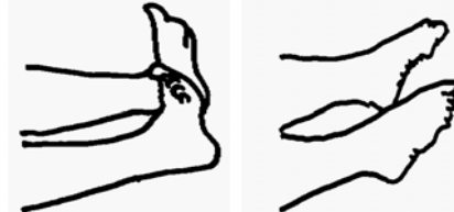
Pointing the Foot