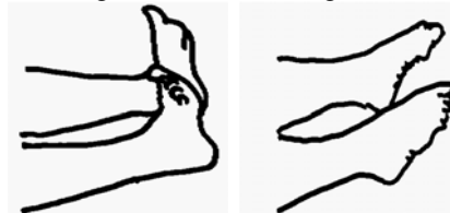
Pointing the Foot