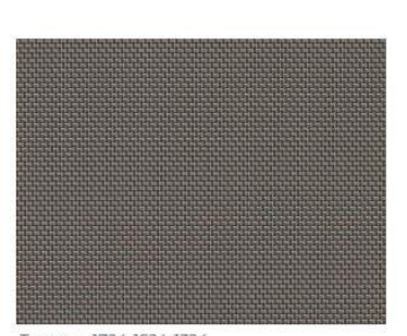
Taupe • 1724, <u>1524, 1324</u>