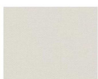
White • 1701, 1501, 1301, 2101

*All Shades colors shall be approved by project manager on all BIDMC Projects.*