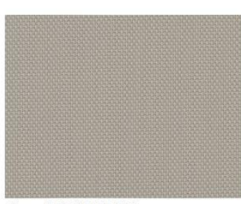
Grey - 1713, 1513, 1313, 2113