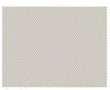
Silver Birch • 1719, <u>1519, 1319, 2119</u>