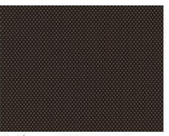
Black/Brown • 1704, 1504, 1304, 2104