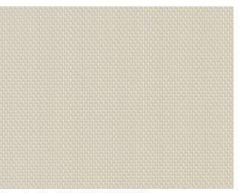
Eggshell · 1716, 1516, 1316, 2116