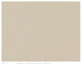
Beige · 1702, 1502, 1302, 2102

Manufacturer: Thermoveil Product: 1500 Series Opening: 3% or 10% Color: Match Existing Building