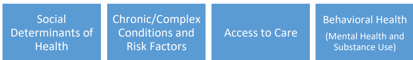
Figure 39: BIDMC Priority Areas 2020-2022

During the later stages of the CHNA process, significant efforts were made to vet the priority issues with leadership and the community-at large, through meetings with the CBC and the CBSLT. BIDMC is confident that these priorities reflect the sentiments of those who were involved in the assessment and community engagement processes. Based on the findings from the breadth of BIDMC’s CHNA activities, the CBC and the CBSLT voted to prioritize 1) Social determinants of health, 2) Chronic/complex conditions and their risk factors, 3) Access to care, and 4) Mental health and substance use.